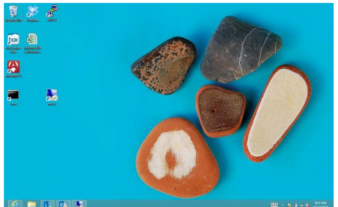
Windows 8/8.1 desktop. This is where you want to launch your Internet browser to go to Power Teacher.